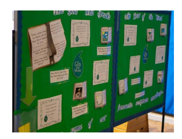
Displays in the school hall enable the children to reflect on The Year of the Word